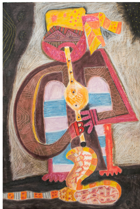
Encantador de Serpientes