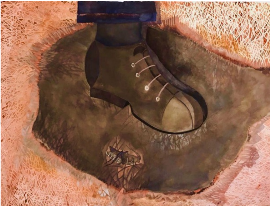
Jardín Rosa, 1974