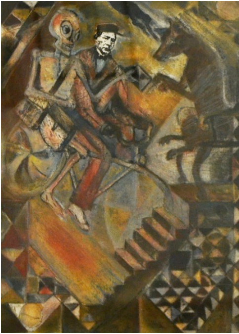
Juárez mailman delivering letters to death, From the series: President Juarez, 1999

Etching, veil, color roulette and photogravure on paper